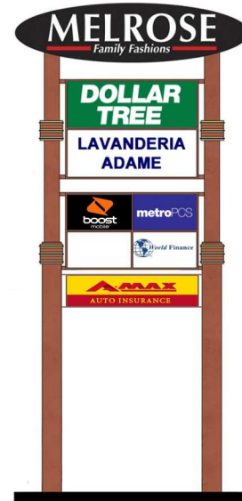
50' PYLON B